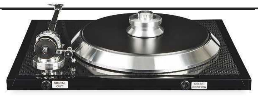
ABOVE: The C-Note arm's counterweight is damped by a sorbothane-like polymer while the nylon thread for the bias outrigger sits in a groove around the arm base, improving stability. The arm/signal out and PSU sockets use colour-coded connectors

unfazed and kept things well balanced. You could perhaps have asked for a bit more detail and definition in the brass, but the background vocals stayed sweet and didn't squawk, and the overall effect was great, a sound full of vitality.